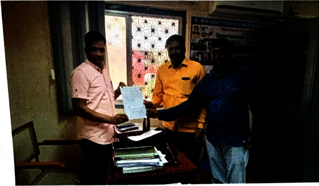
MOU with Mathematics department Dr.BRR college jadcherla